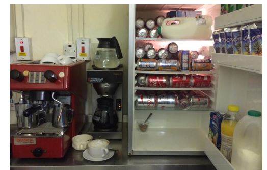
Galley Kitchen Area

These and all other reviews are 5 Star ratings.